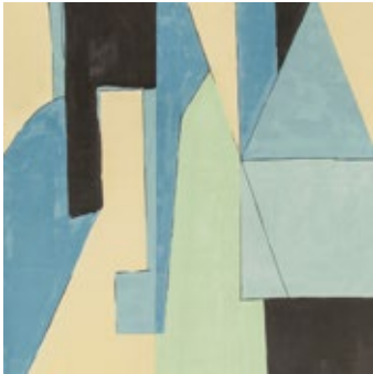
DISTRICT COBALT GWP 3721.115