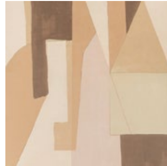
DISTRICT SILT GWP 3721.167