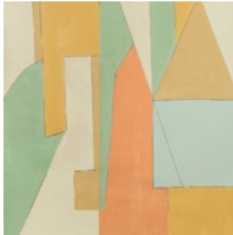
DISTRICT TAWNY GWP 3721.134